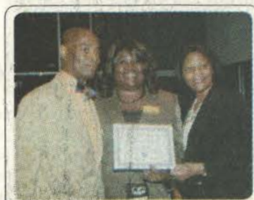
Houston Black Real Estate Association 2013 Realist Week