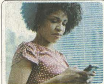
Social Security New Mobile Site for Smartphone Users