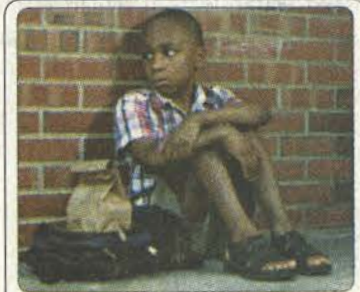
Children Need to Fly, Too, to End Sequestration